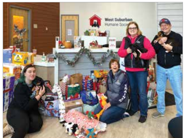
Enjoy Your Dog